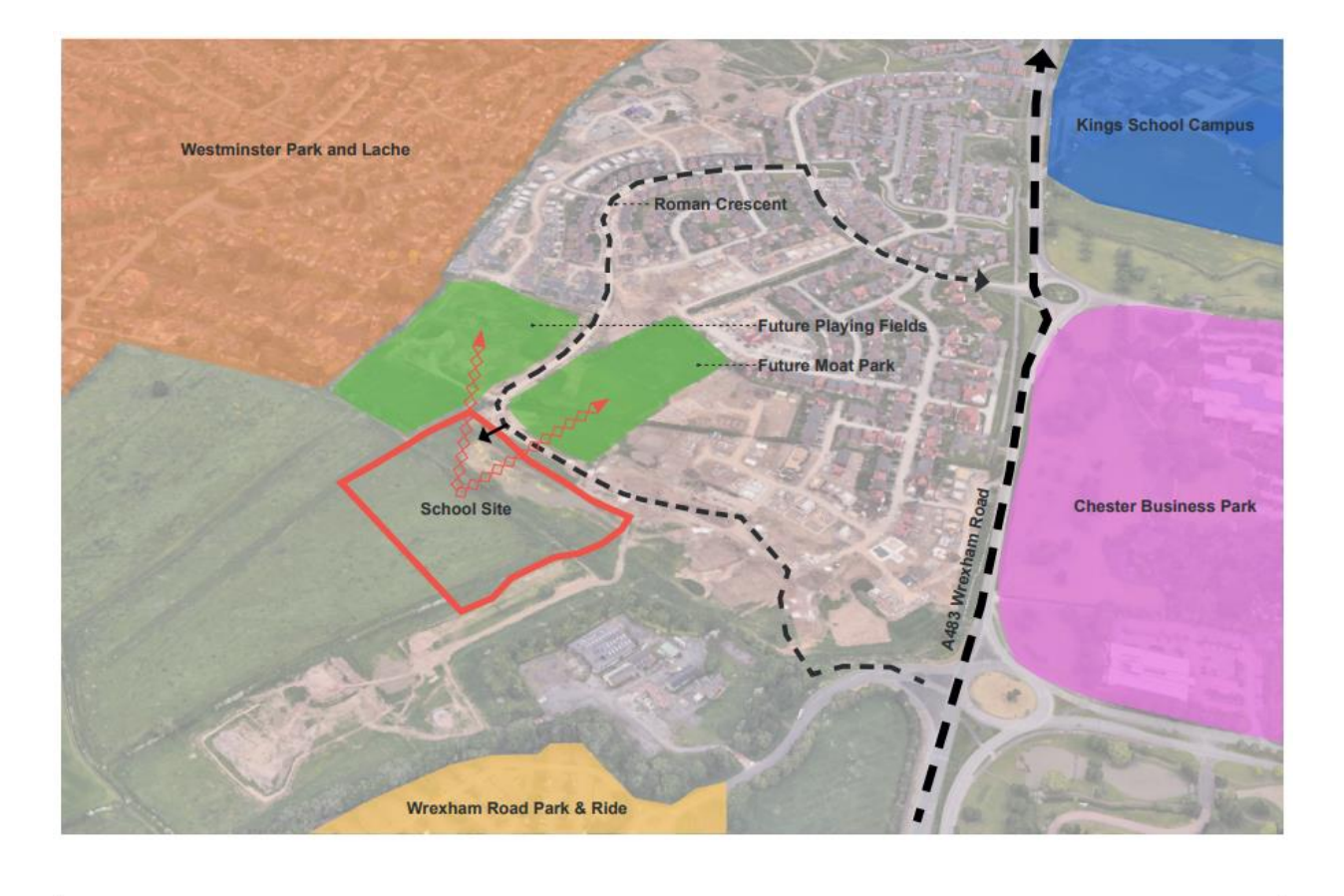
Image 03 Google Map Overlay to illustrate surrounding context to development

The school site will be accessed from the A483 [Wrexham Road] which is one of the primary vehicular arteries into Chester city centre [Black Dash]. The new residential development will be serviced by a main boulevard that links between the two roundabouts currently servicing the Chester Business Park, with the school site vehicular access point designated for the North end of the site. There are a number of other land uses that provide the context for the development site: