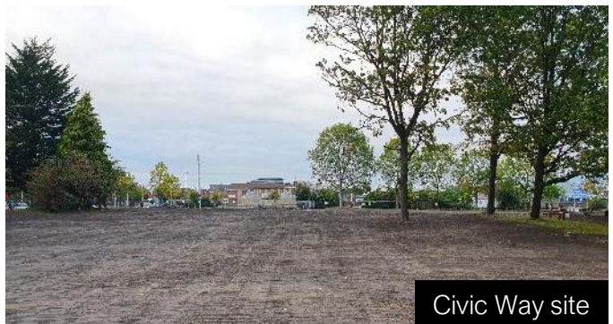
Civic Way site

The demolition of these buildings is part the Council's wider town centre regeneration project that is unlocking sites for the development of new low-carbon homes. The aim is to demolish older and redundant buildings to enable a housing developer to build new low-carbon first-time buyer and family homes and help increase footfall in the town centre. We are currently reaching out to developers discuss the future housing provision at these sites to ensure that this project moves forward quickly after site assembly works are complete.