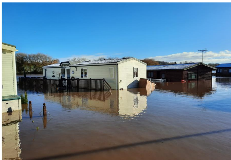
Figure 3 - Lakeside Caravan Park, 21/01/2021

C&RT have reported that the sluice gate at Vale Royal was fully open during Storm Christoph.