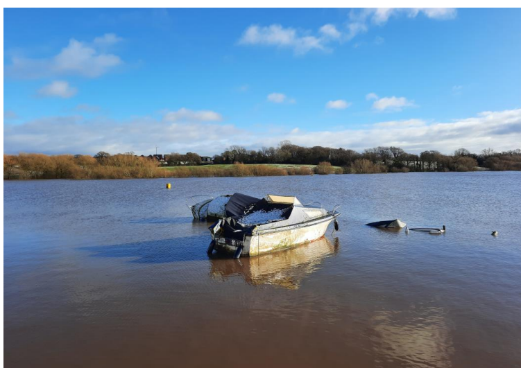
Figure 4 - Lakeside Caravan Park – Boats on the Flash. 21/01/2021

Source: Business manager of the Lakeside Caravan Park