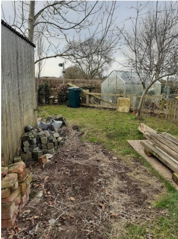
Above – current stile at junction with FP21 Barrow, plant garden Below – direction of commencement of diversion facing north-east