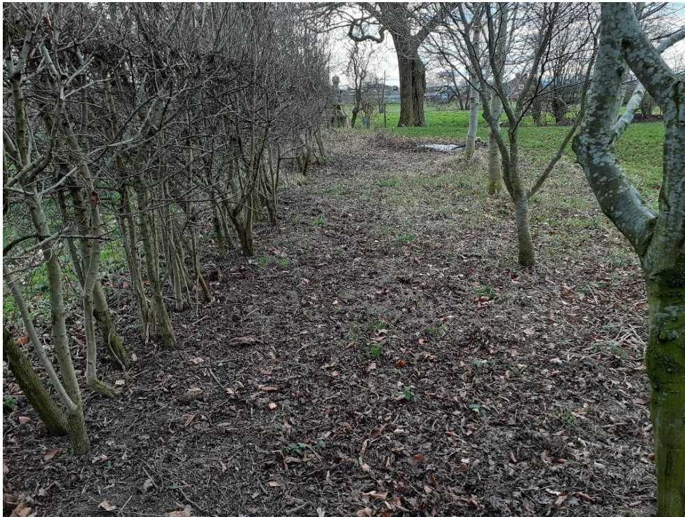
Towards termination of proposed diversion facing south west, garden boundary. On left