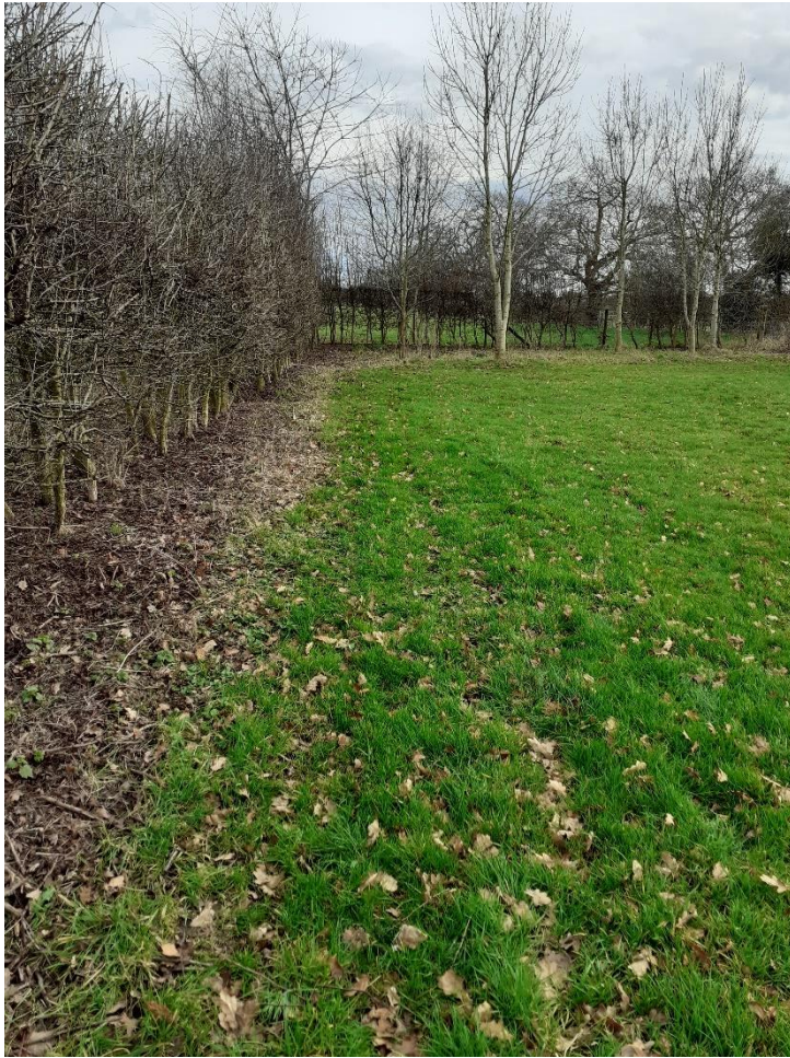
Trees at south eastern area of proposed new route