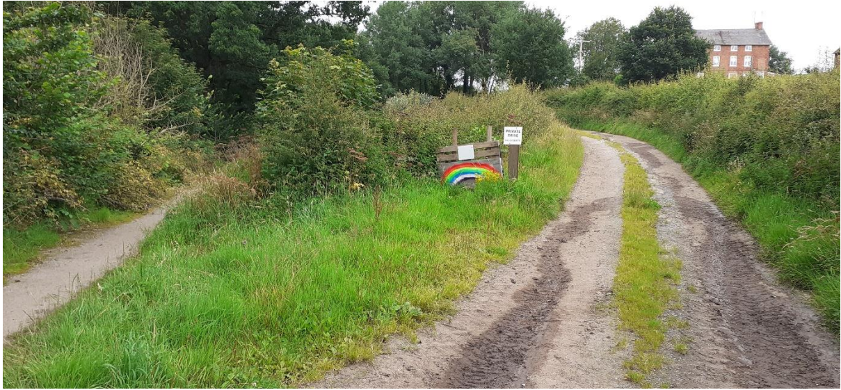
Junction of FP68 with RB 75 (Point B)