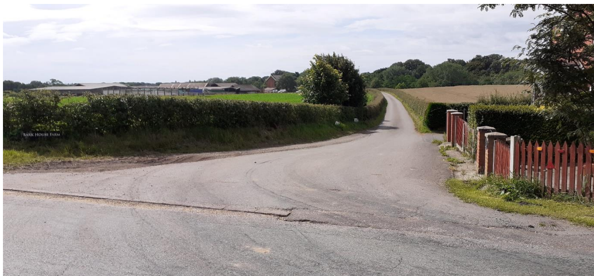
From Mill Lane