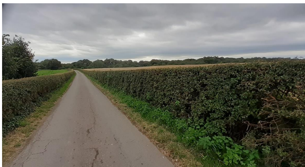
Drive to farm at Point A