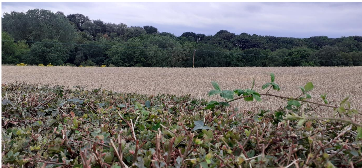
From Point C looking south to Point E at the telegraph pole in front of the tree line