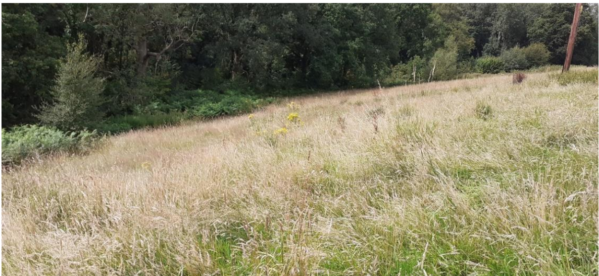
Meadow sloping down to the gap above RB75