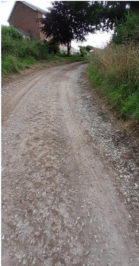
Track on south east side of the farmyard