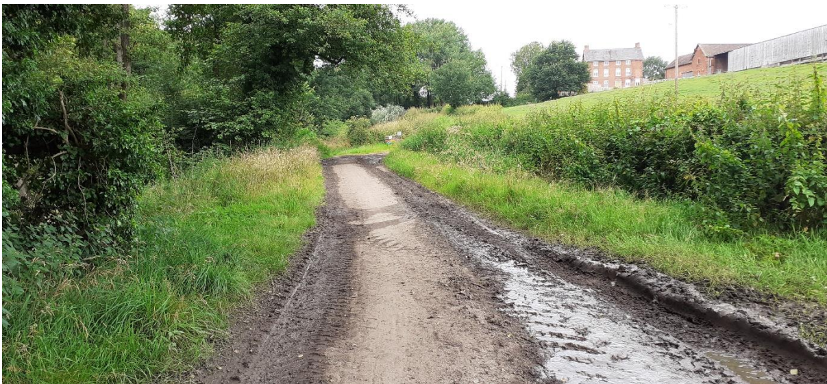
Length of RB75 from Point A towards Point D