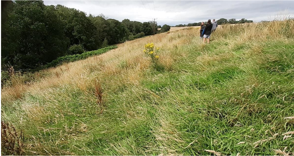
Meadow between point E and the tree line along RB75