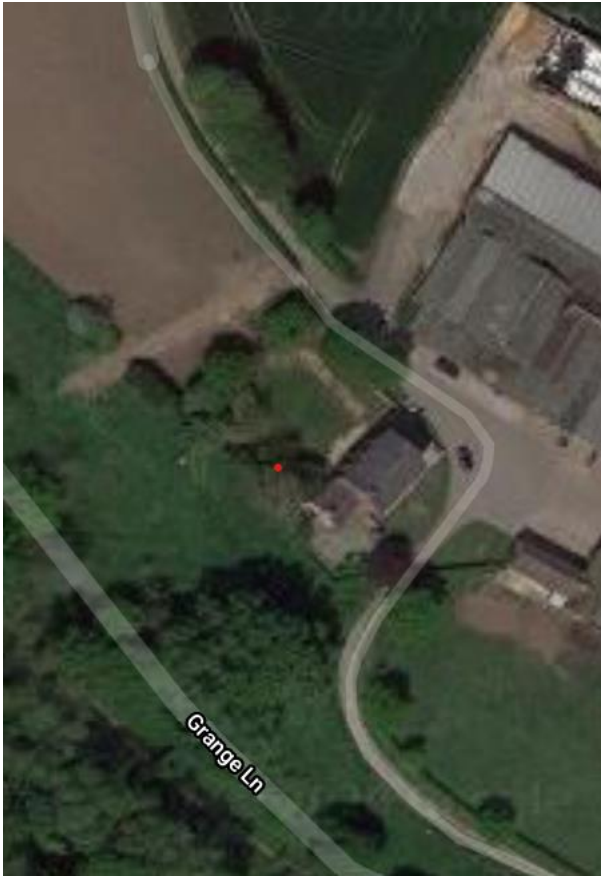
Route through farm buildings