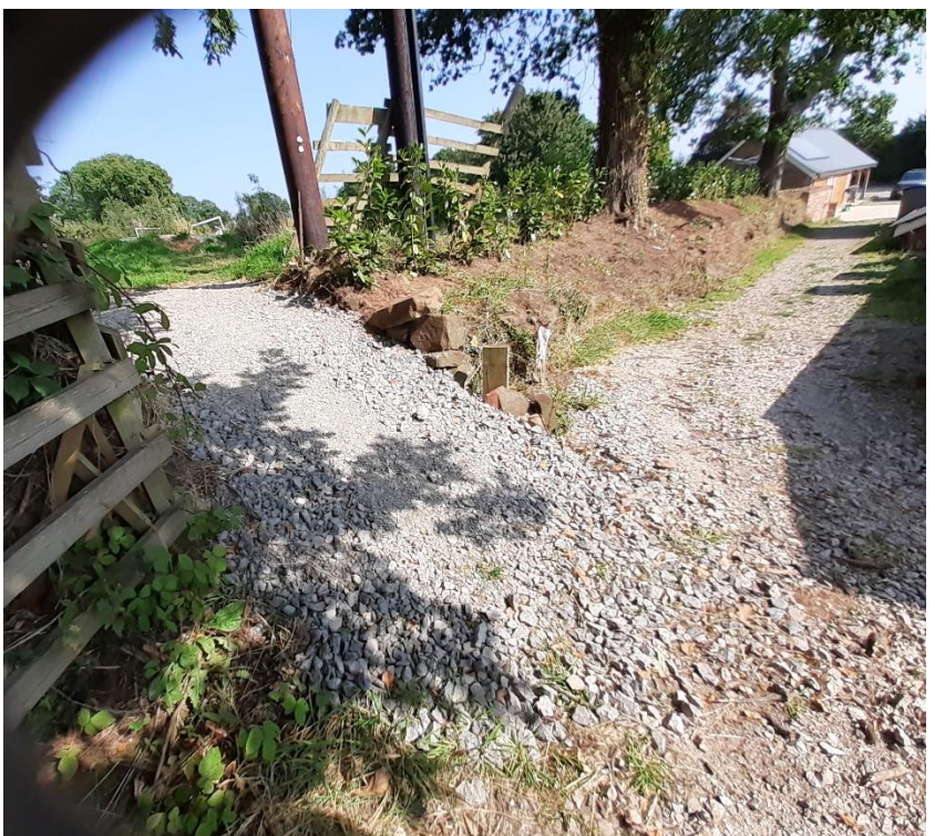
Line of FP20 and the proposed diversion route on left of image Level Difference between current and proposed. Groundworks to decrease current slope incline. Telegraph poles and guy cable mid image.