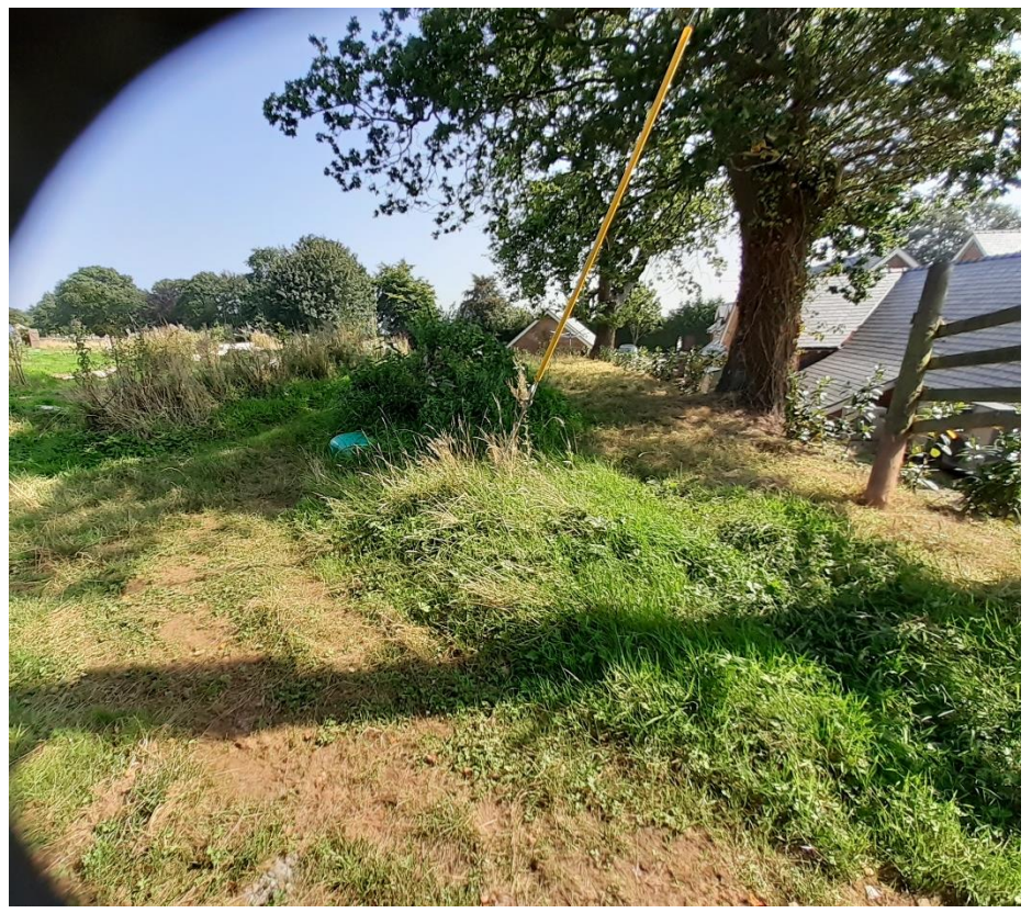
Proposed route of FP20 diversion avoiding guy cable. Levelling and gravel surfacing for FP20 diversion to connect with FP21 at line of trees in image.