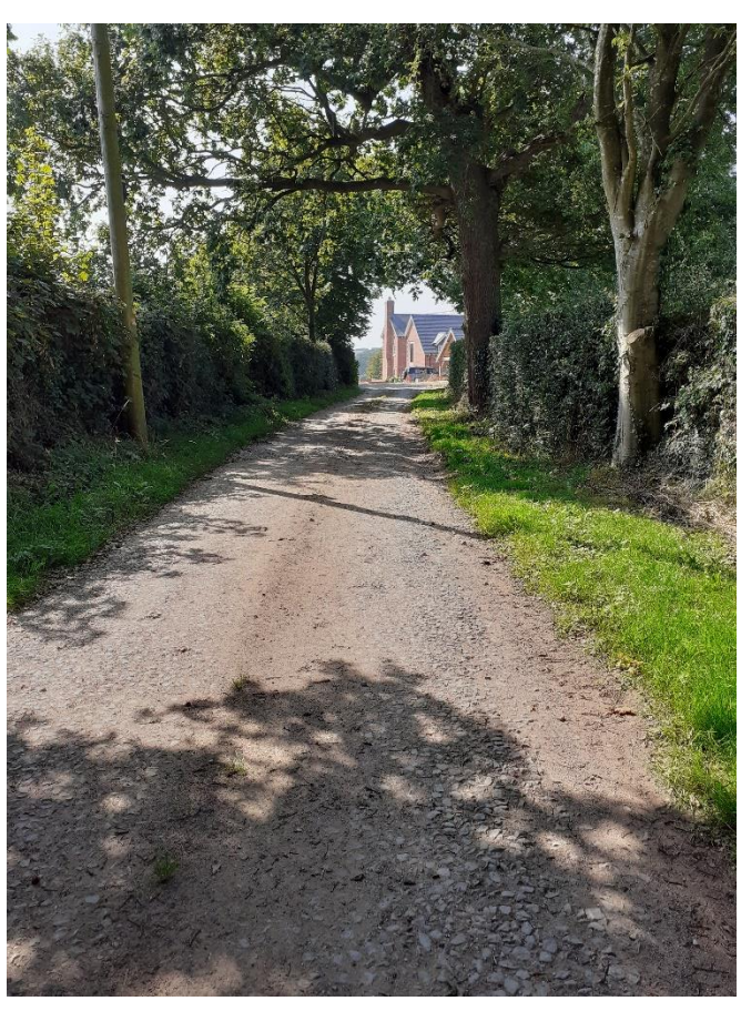
Appendix A Images of the footpaths and proposed diversions