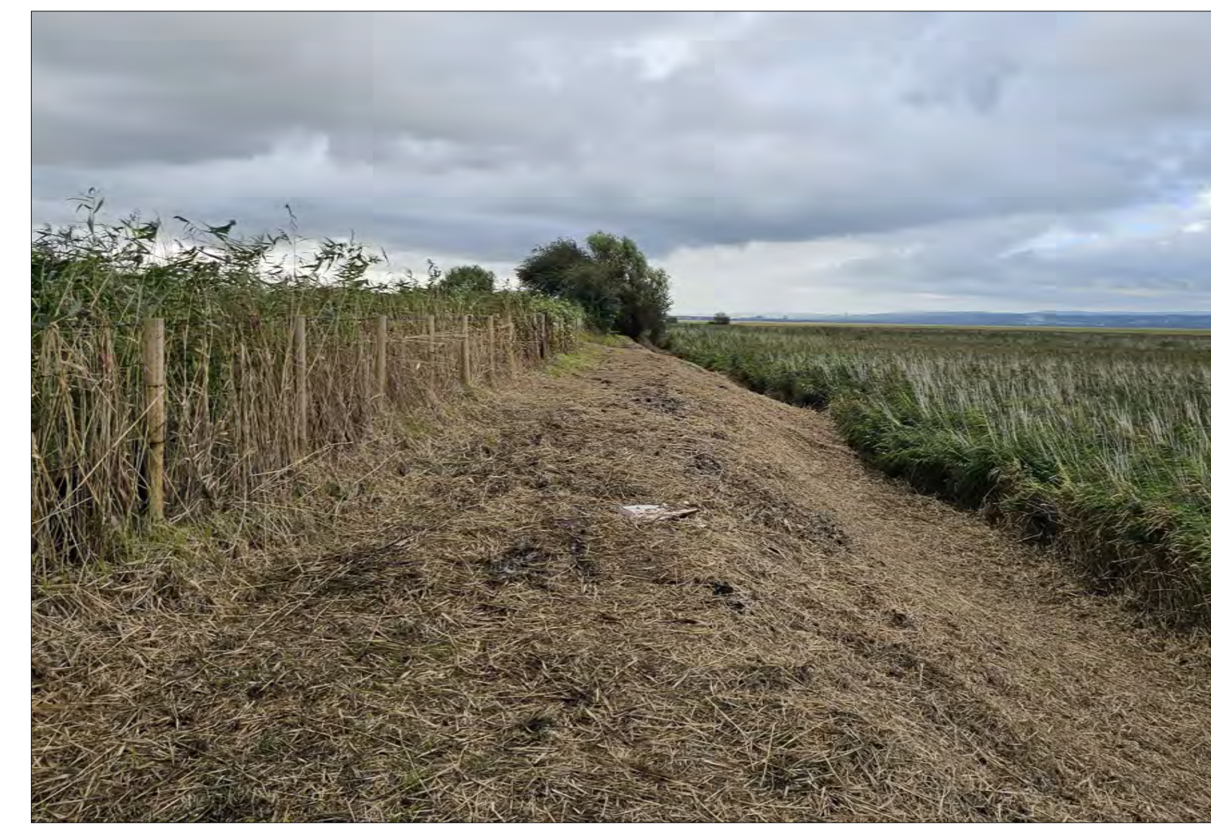
EXISTING VIEW OF FOOTPATH