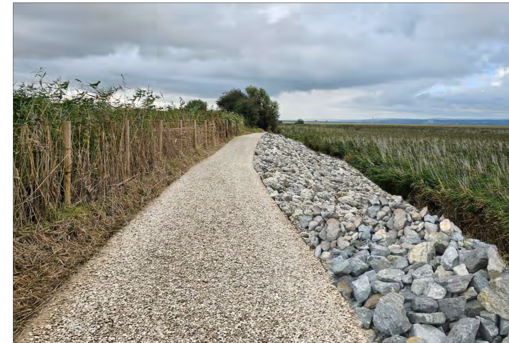
ARTISTIC IMPRESSION OF PROPOSED FOOTPATH ** Path will be allowed to Re-wild upon completion