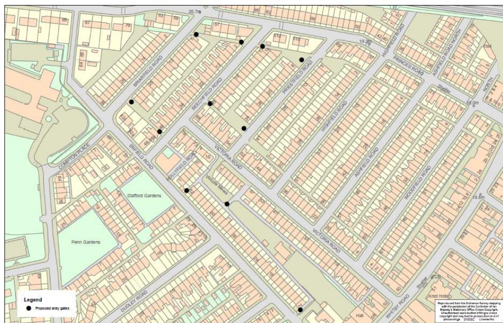
Proposed gating order - Enfield Road, Beechfield Road, Briarfield Road, Priestfield Road. (No.4 S129A Highways Act 1980 Ellesmere Port) Order 2012

3.1 A proposal to make an Order under Section 129A Part 8A of the Highways Act 1980 to gate public footpaths, between Beechfield Road towards Briarfield Road, Beechfield Road towards Priestfield Road and Enfield Road in Ellesmere Port.