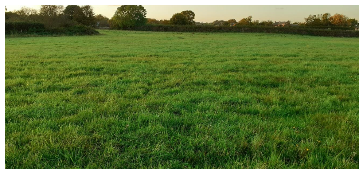
From Point A looking north west along location of proposed diversion