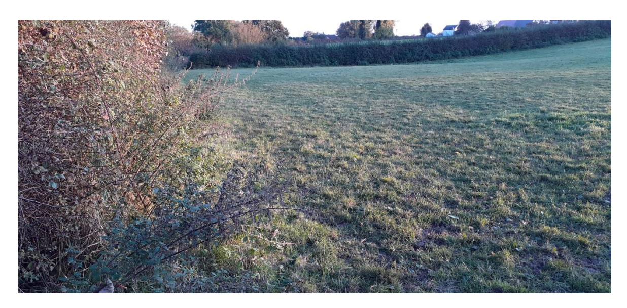
Stile between first field and second field