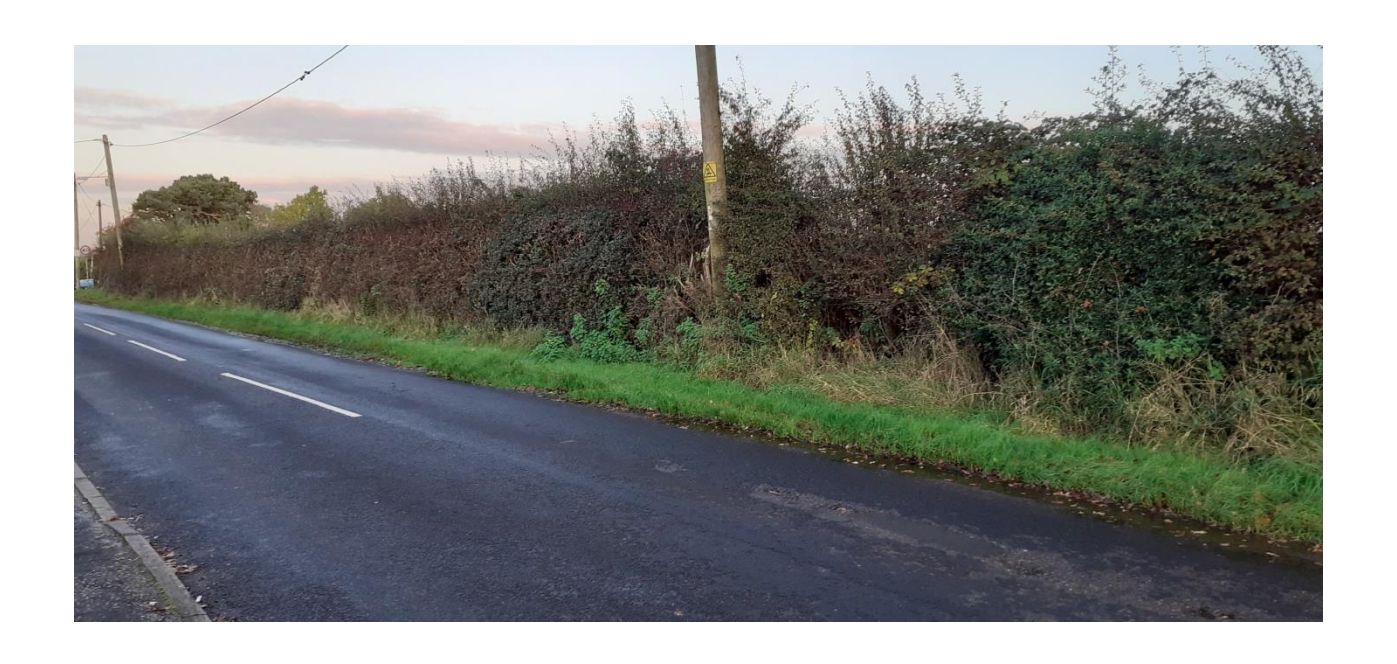
Middle Lane hedge line and, below, point of termination at Point C