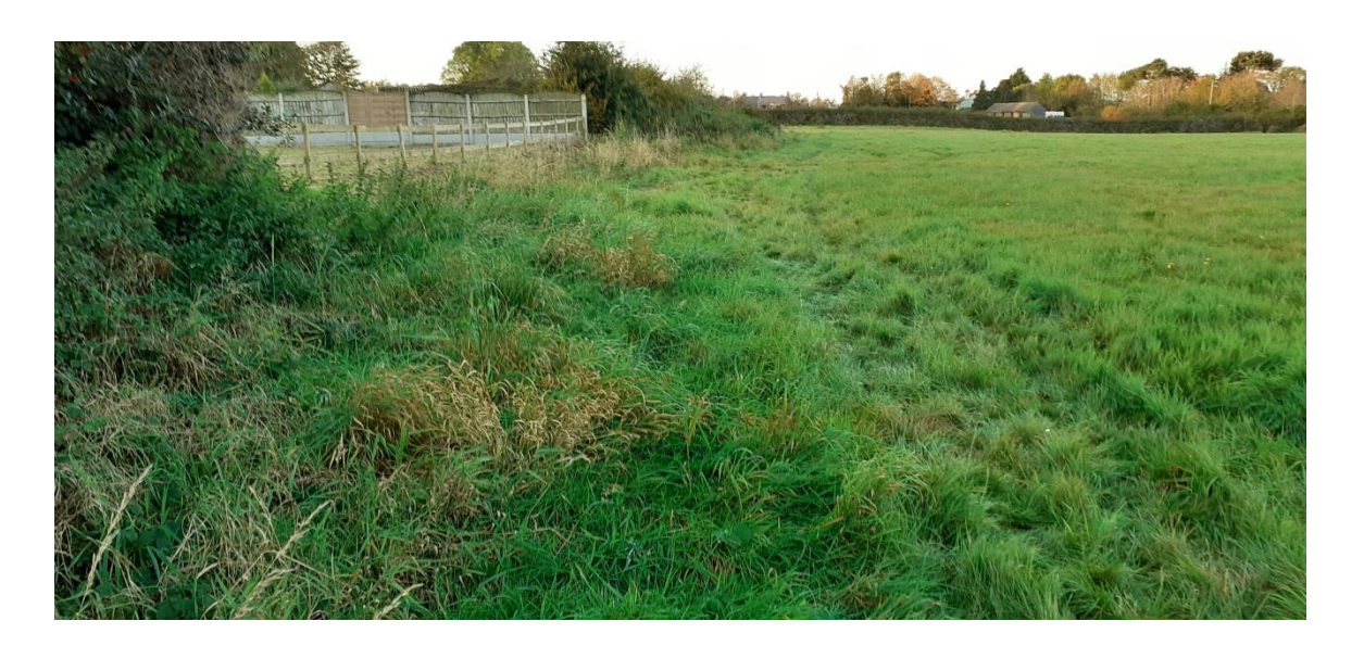
From point A to gate and gap into first field