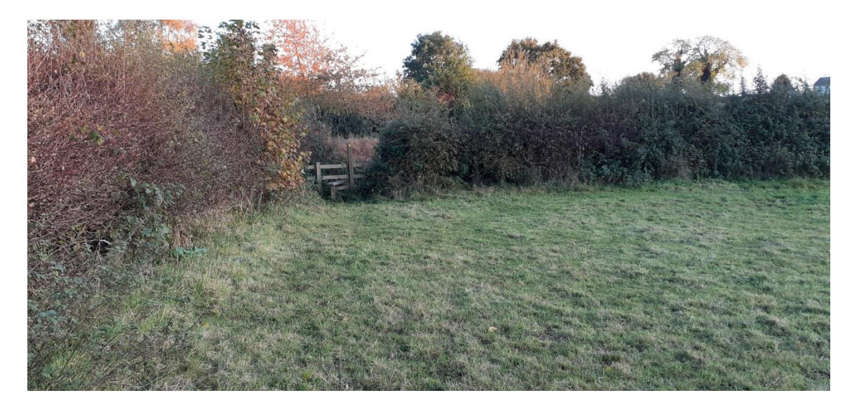
Below: from stile looking towards point B