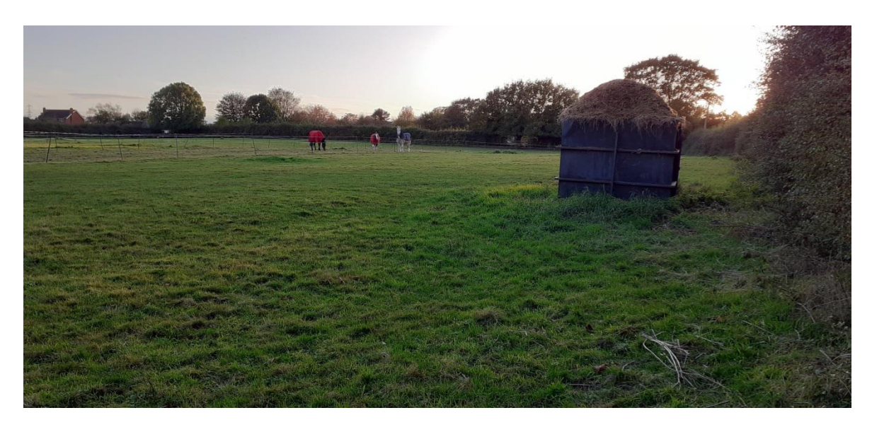
Field adjacent to Hollow Lane