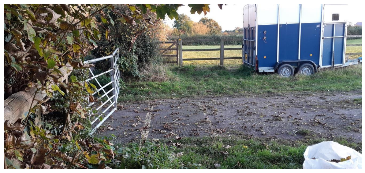
Continuation of footpath south of stable and through gate and into field