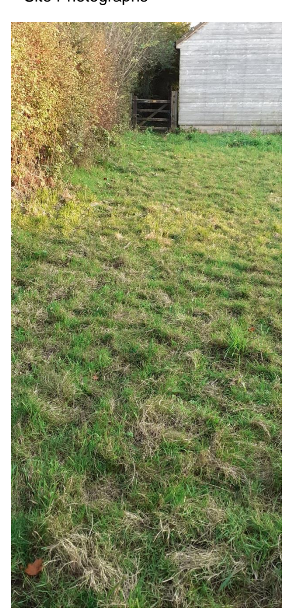
APPENDIX A Site Photographs

Running south from Point B, existing stable building and footpath between hedge and building