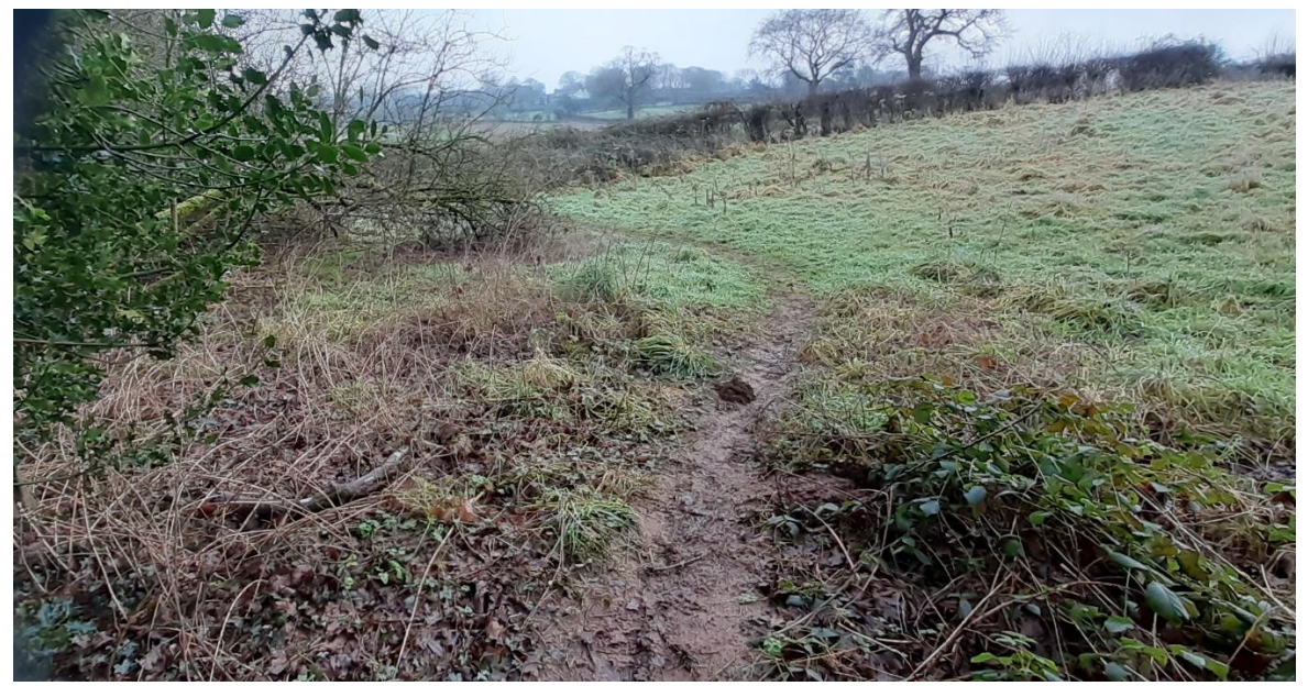
First field above, leading to second stile below