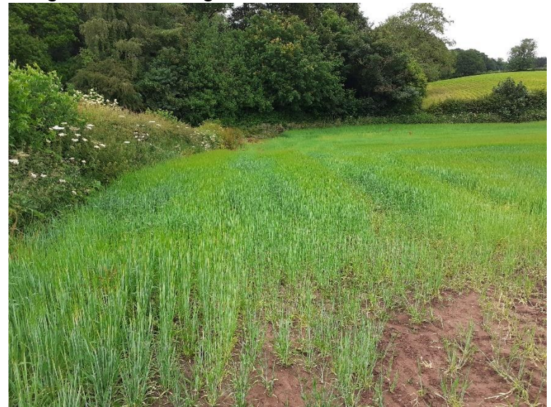
Image below looking back to the stile, current route on right of hedge in arable field