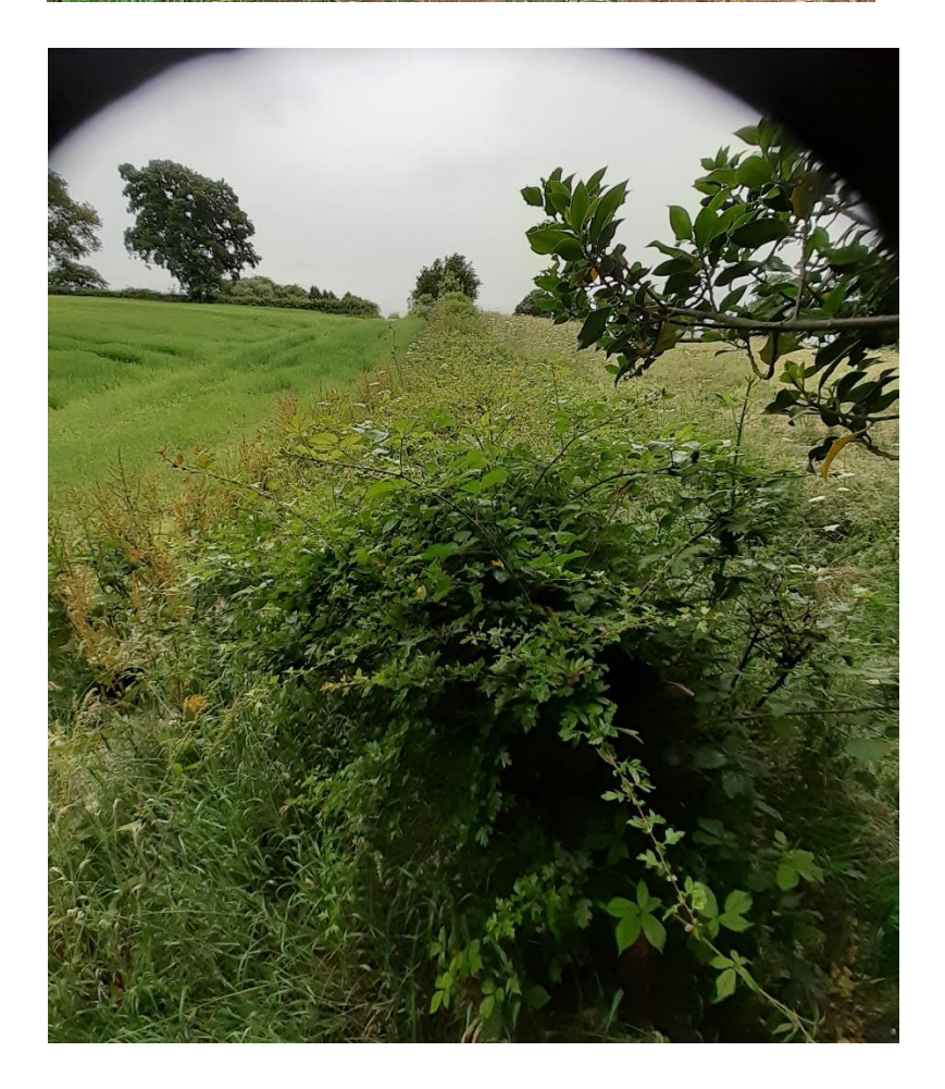
Image of the boundary hedge facing east (current route on left side)