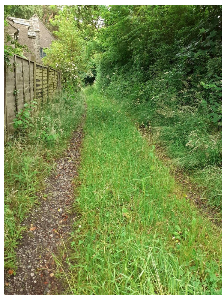
Rear of Tirley Lodge in image above, first stile of two into the first field