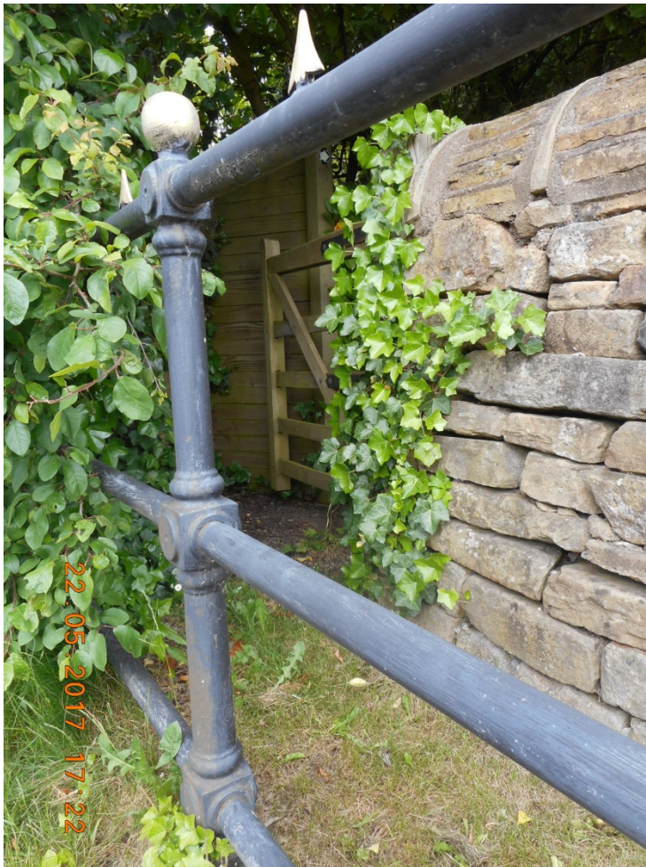
Existing wooden pedestrian gate; Verge railings