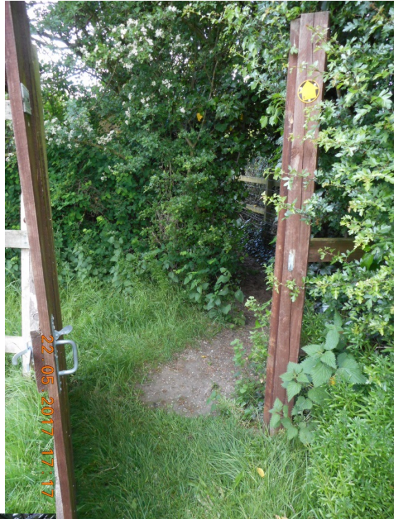
path beyond gate