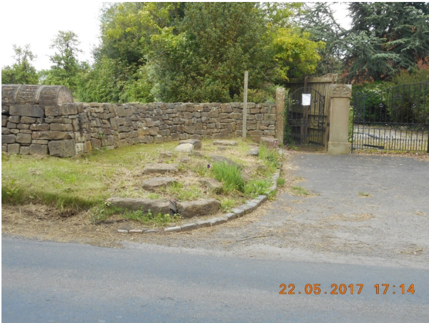
Junction with Hill Top Road