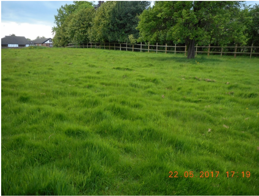
Existing rail and post fencing