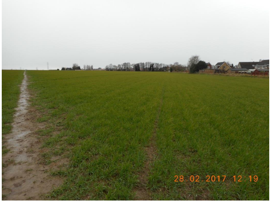
Footpath 9 view towards Penistone Drive