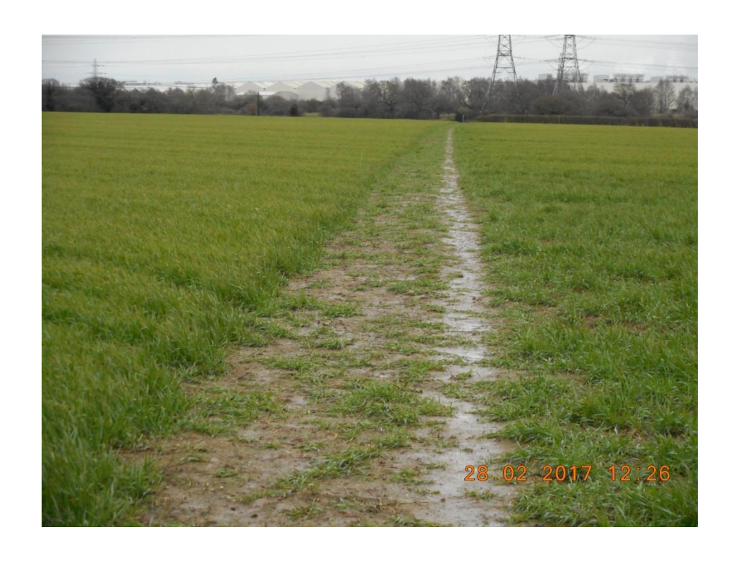
Footpath 7 towards Ledsham Road