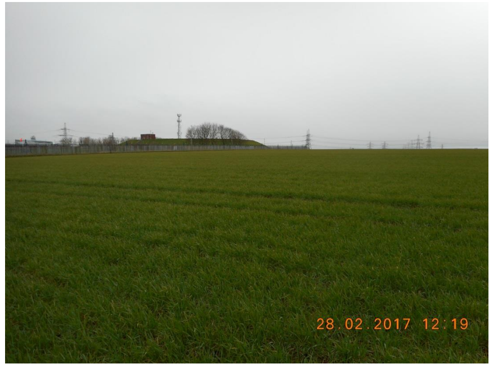
Footpath 9 view towards water treatment works