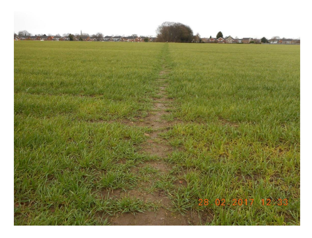
Footpath 45 towards Penistone Drive