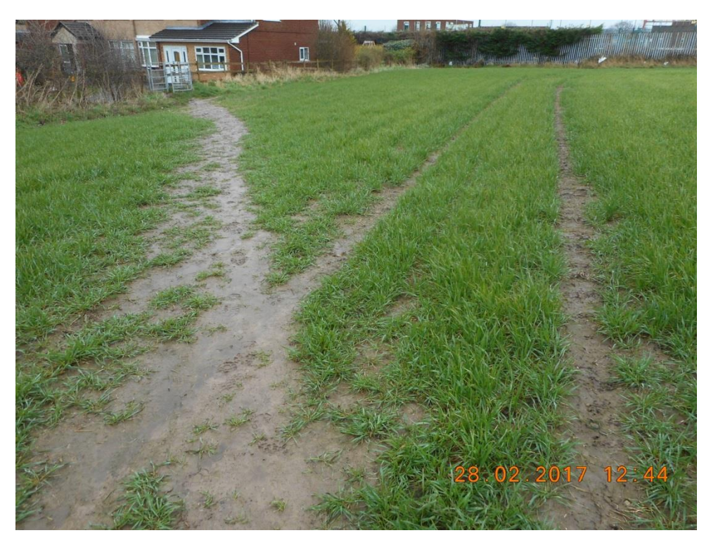
Gate at Gerrard Avenue at Footpath 9