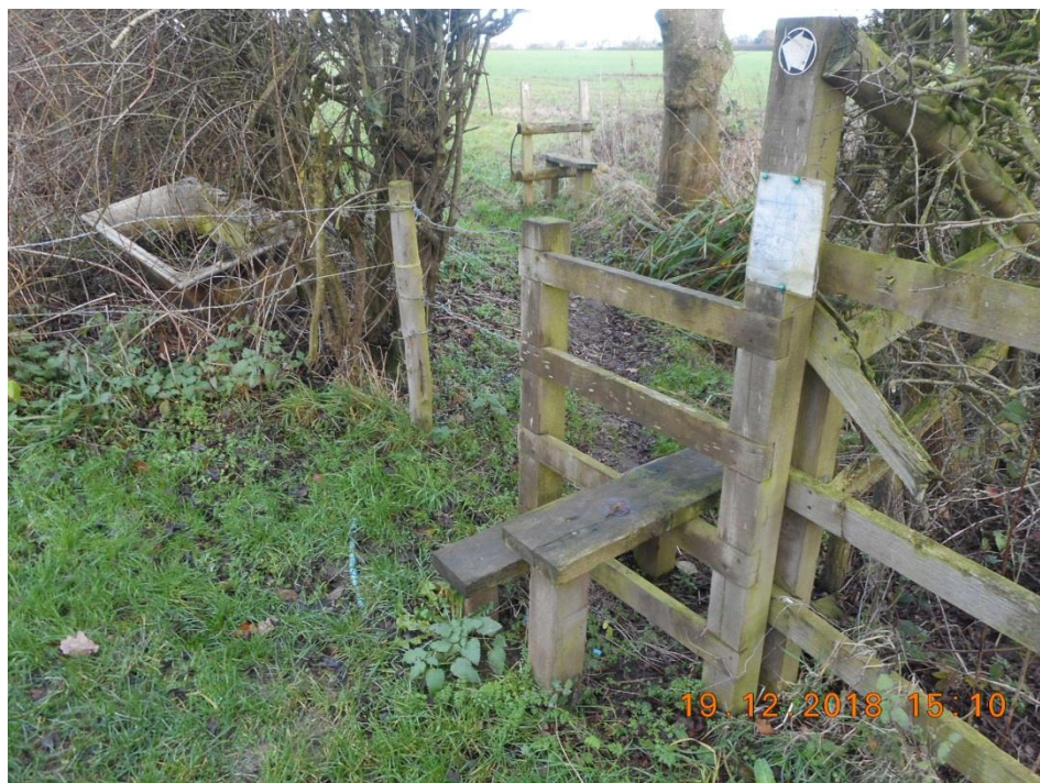
Two stiles crossing Into field