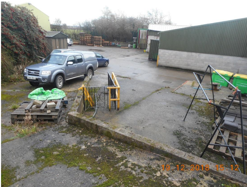
Footpath runs Left to right between buildings