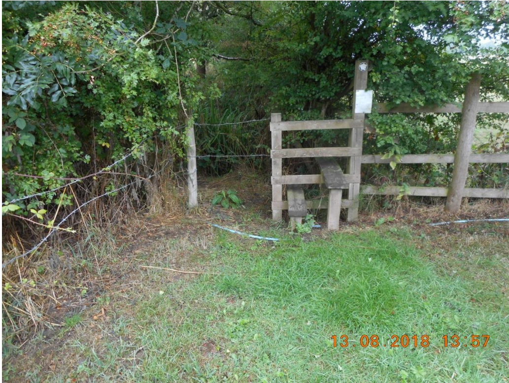
diversion commences from stile