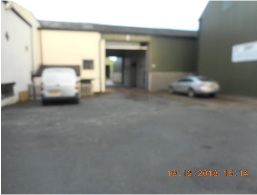
footpath through agricultural buildings