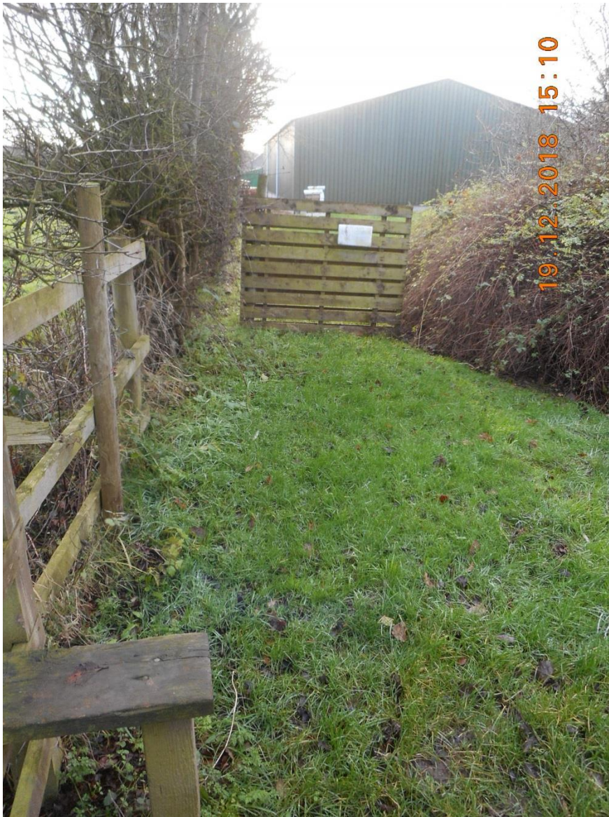
agricultural building obstruction