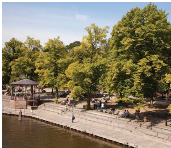
The Groves Riverside