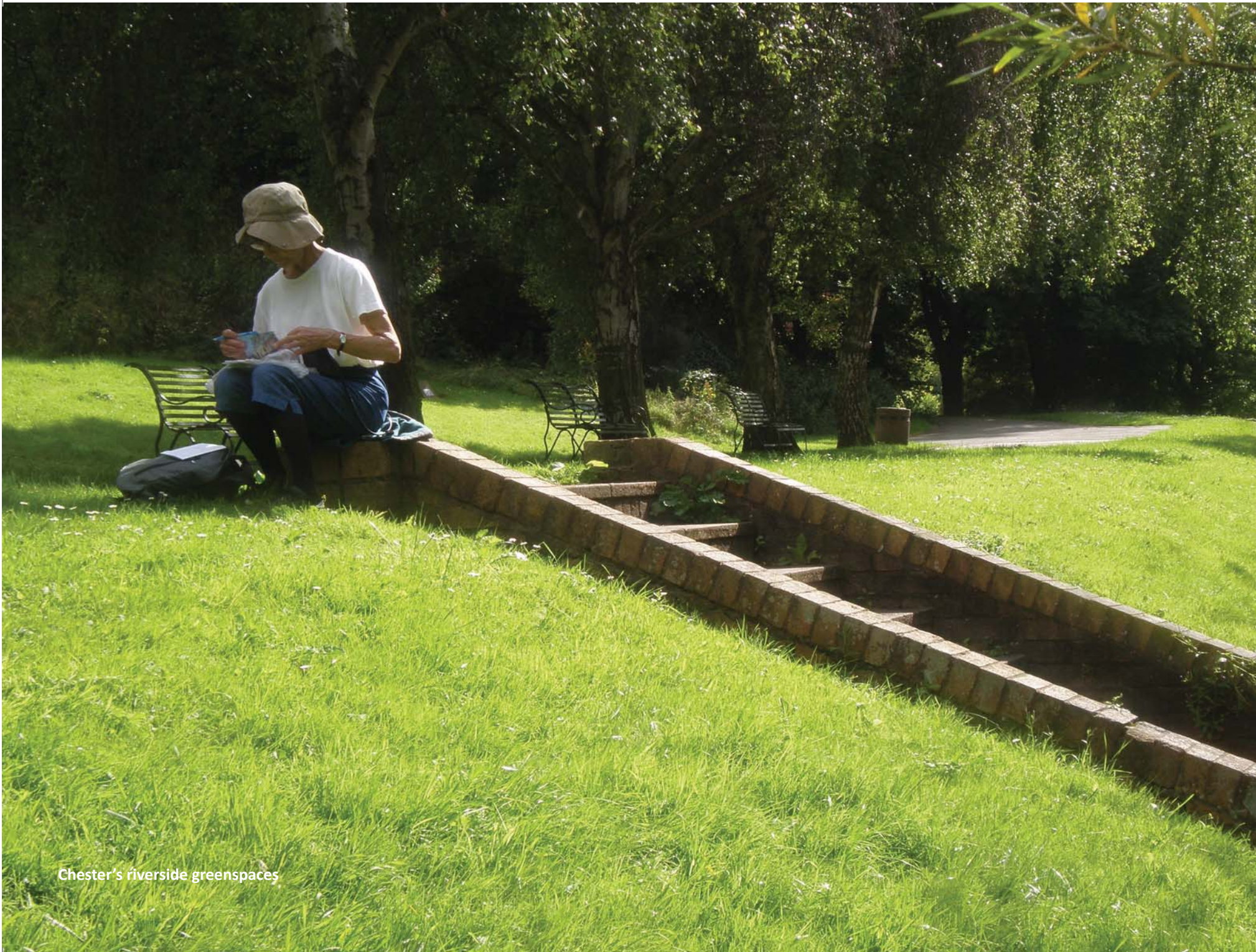
Chester's riverside greenspaces