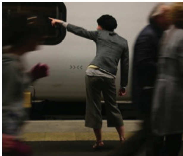
Station Stationary dance installation as part of the Cheshire Year of Gardens by The BodyCartography Project and Cheshire Dance, Crewe railway station.

Temporary artwork can also be commissioned in an opportunistic manner to improve the public realm, such as through the use of empty shop fronts to animate the street and the creative use of sites awaiting redevelopment.