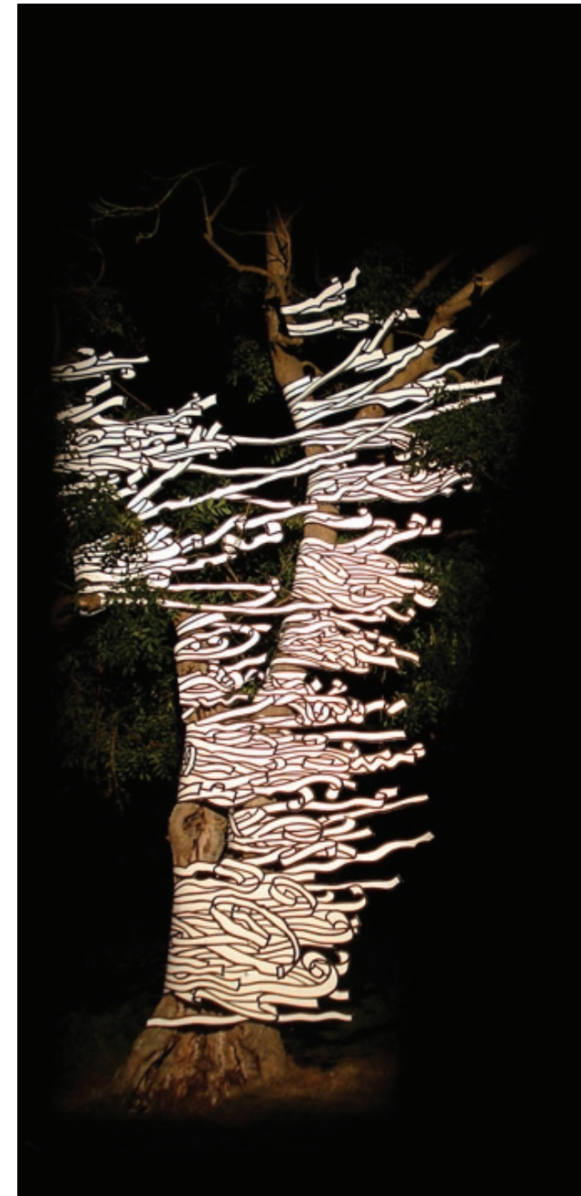
Airstrip, ash tree installation at Big Chill music festival, 2006 by Tod Hanson©