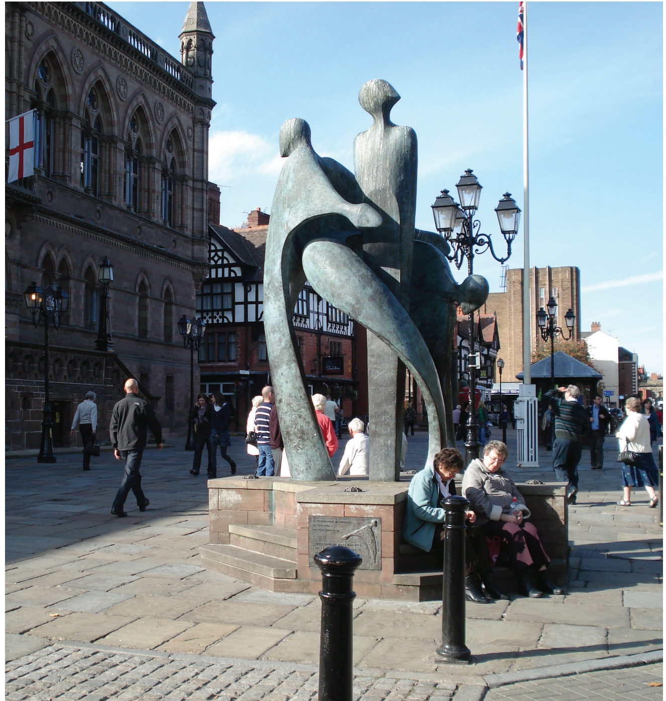
'A Celebration of Chester' in front of Town Hall

Chester displays a long history of art elements incorporated into buildings and the built environment which add to the locally distinctive nature of Chester's architecture and public spaces. Where commissioning is carried out or suggested it tends to be figurative and in bronze. Bronze is seen as a quality material and figurative work less challenging.