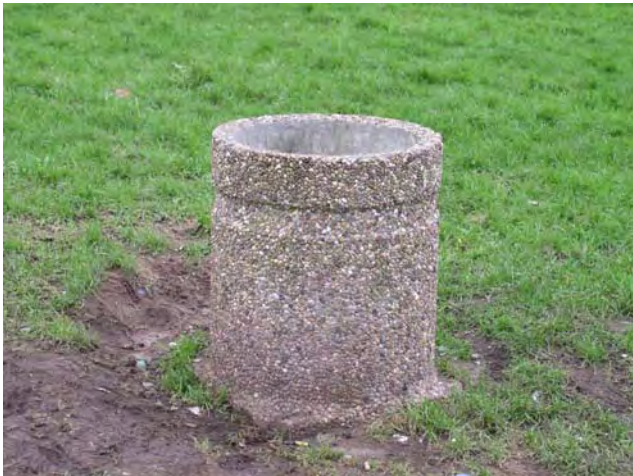
Crude concrete bin unsympathetic to the character of area