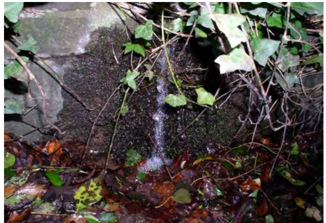
Natural spring emerging on Howey Lane