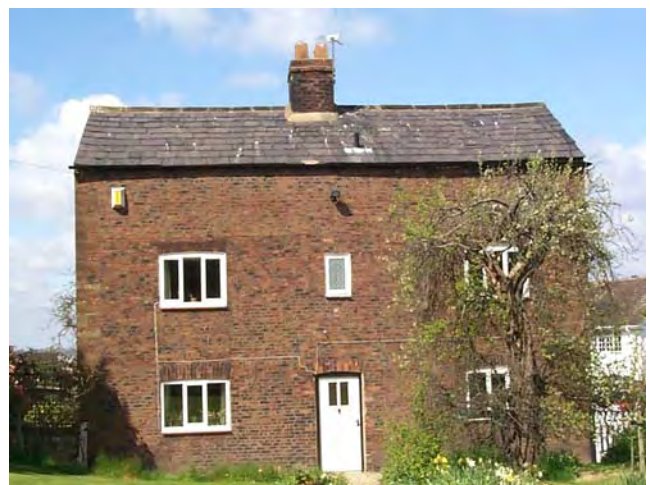
Grade II Listed 'Church House Farmhouse'