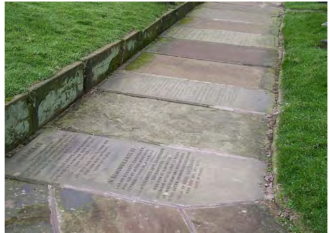
Combination of gravestone and flag paving