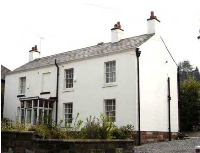
'Roseville' Georgian property, Hillside Road