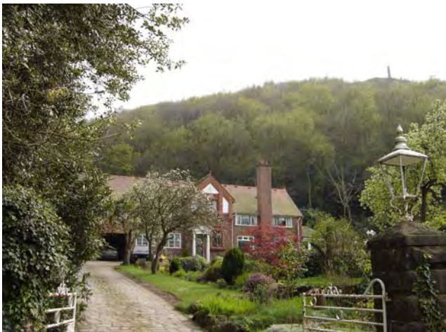
‘Woodlands’ (No. 31 Howey Lane) occupying a dramatic setting