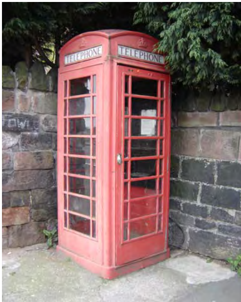
Badly faded K6 kiosk with missing glass panes