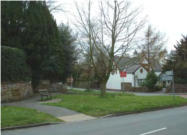
Seating area at junction between Church Road and Vicarage Lane