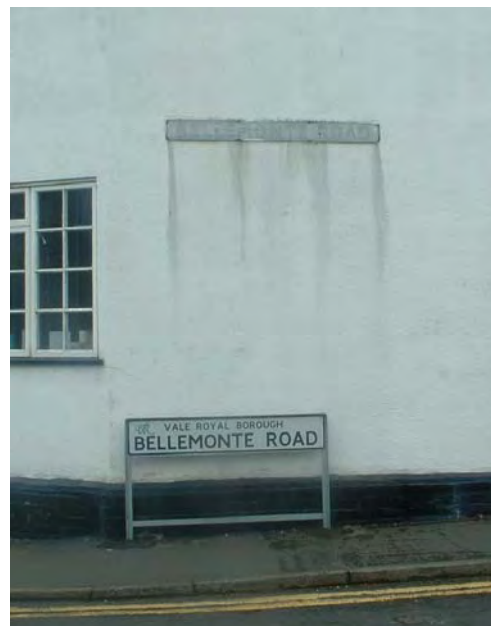
Modern street name sign below neglected traditional one