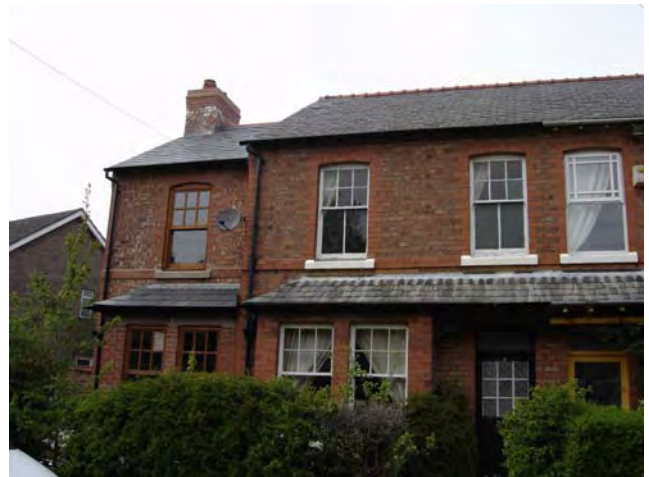
New, sympathetic extension to No. 8 School Lane