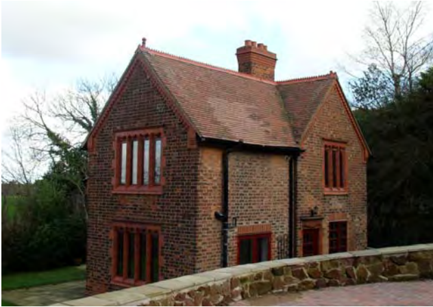
'Pinmill Cottage' featuring terracotta detailing