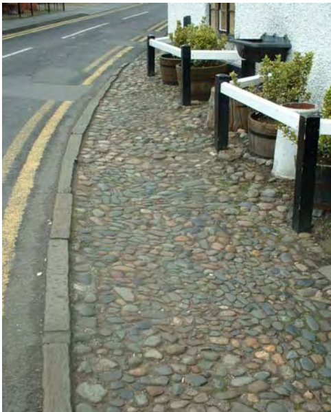
Cobblestones adjacent to 'Ring O' Bells' Inn