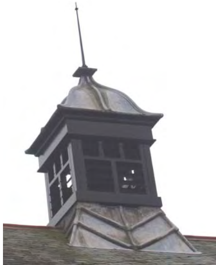
Bell tower upon the original Frodsham Church of England Primary School building