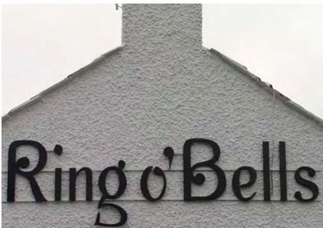
Advertisement on north elevation