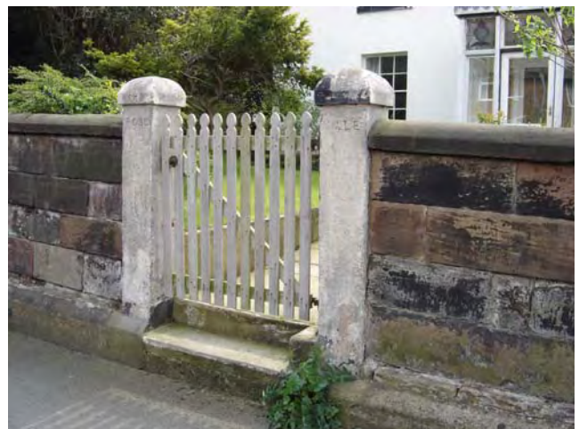
Wall and gate piers to 'Roseville' Hillside Road.