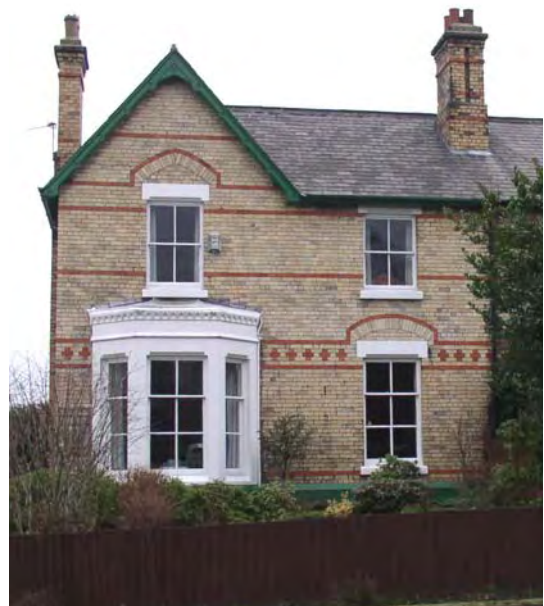
'Thornhill' (No. 93 Fluin Lane) – Yellow brick with decorative brick banding