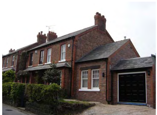
New, sympathetic extension to No. 2 School Lane