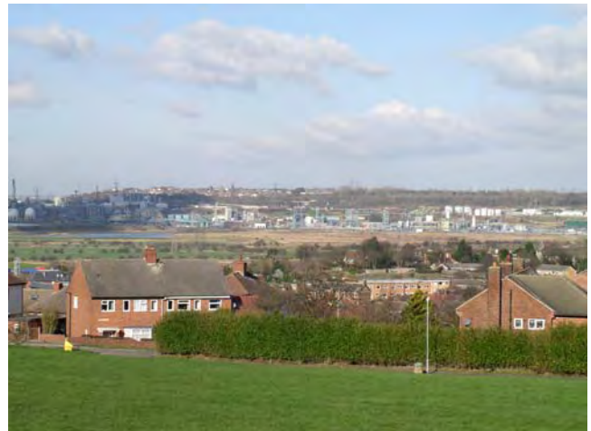
View north towards industrial clutter of distant chemical works