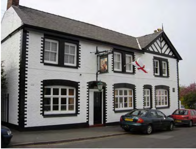
'Bulls Head' public House, Bellemonte Road