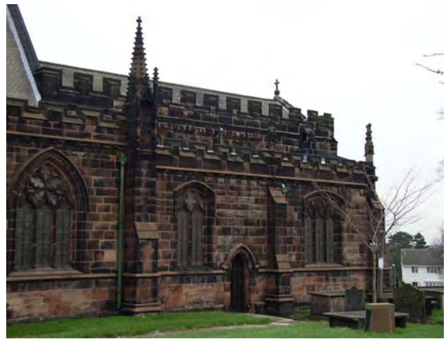
Revival gothic detailing to south elevation of St. Lawrence's Church