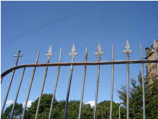
Decorative spikes to church car park railings