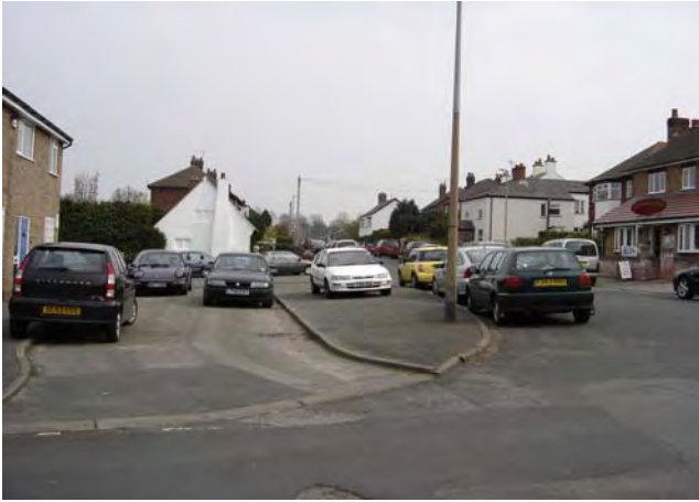
Mass sprawl of vehicles reinforces parking issues in the vicinity of Hillside Road