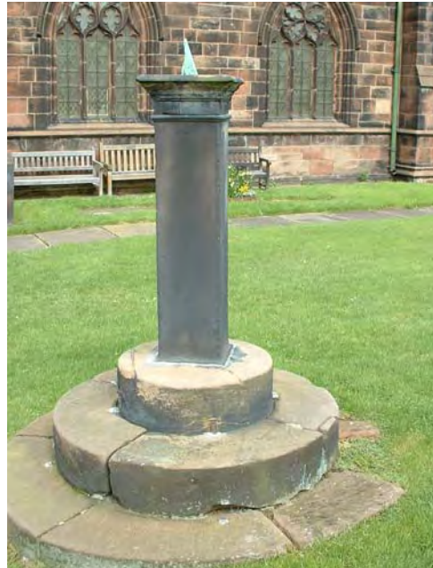
Sundial in the yard of St. Lawrence's Church