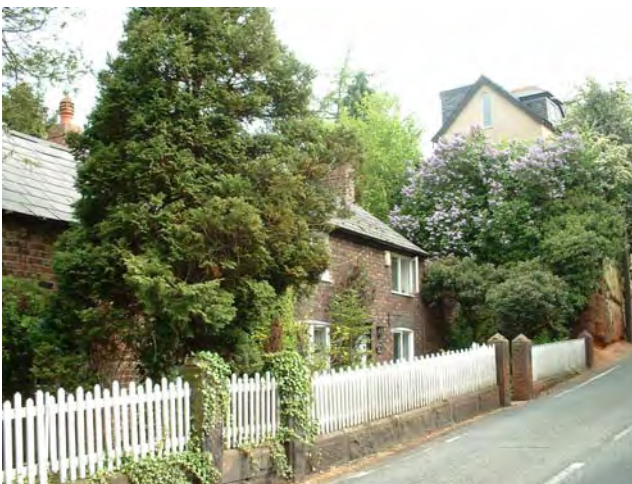
Cleft timber pale fence and low sandstone wall to No. 26 Howey Lane