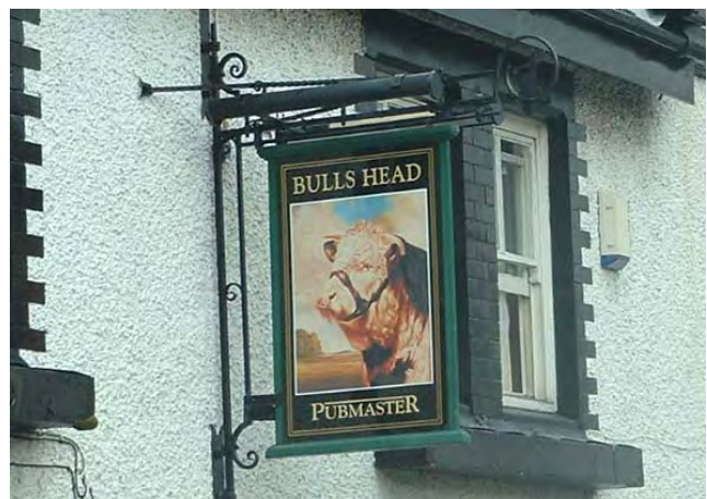
Main sign to 'Bulls Head' public house