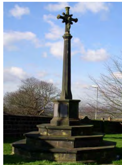
War memorial in grounds of St. Lawrence's