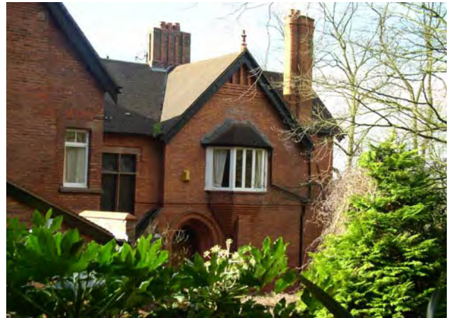
No. 35 Howey Lane, large Victorian property