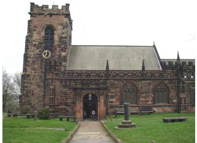
St. Lawrence’s Church and tower