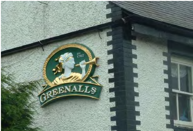
Advertisement on south elevation of 'Bulls Head'