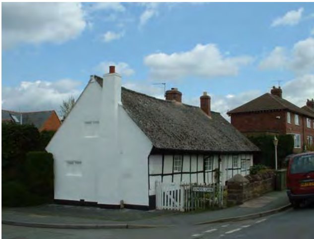
Grade II Listed No. 56 Hillside Road