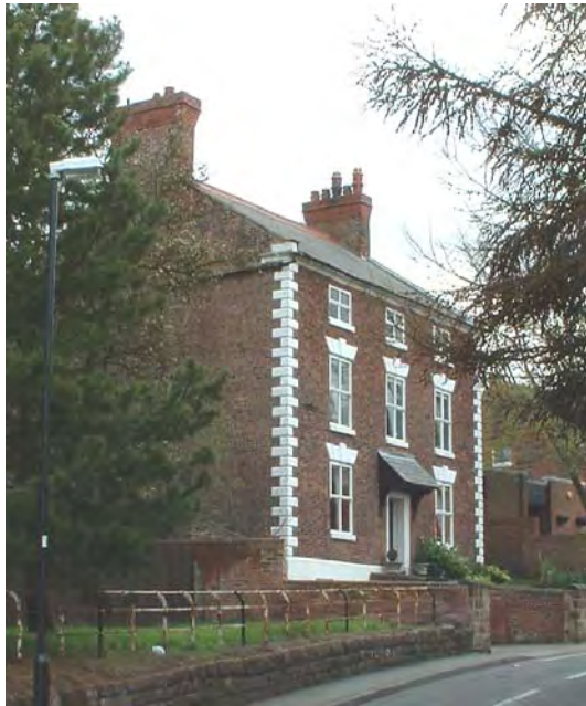
'Overton House' Georgian property, School Lane