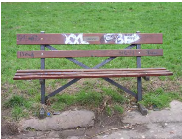
Graffited park bench in poor state of repair