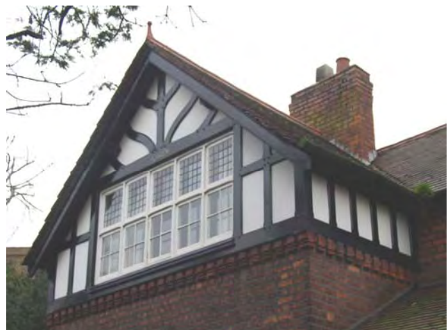
Timber framing and interesting dentil course on No. 25 Howey Lane