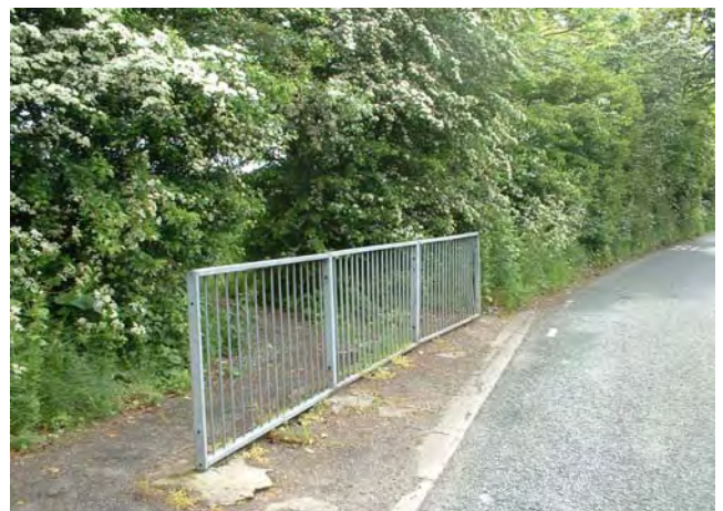
Modern pedestrian barrier railings, Pinmill Brow