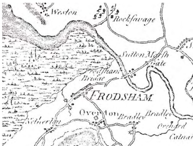
Extract from Burdett's map of 1777