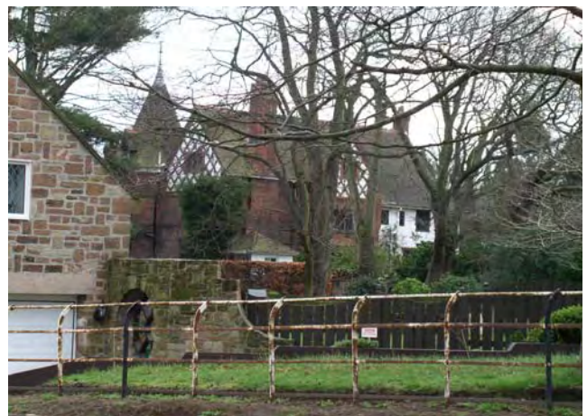
'The Old Vicarage' viewed from Church Road