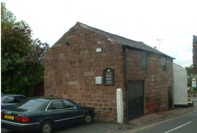
Outbuilding adjacent to 'Ring O' Bells' Inn