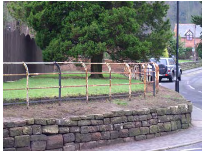
Cheshire railings at 'Roebuck Cottage'