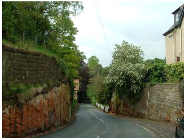
Exposed sandstone bedrock along Howey Lane