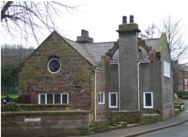
'Roebuck Cottage' Church Road