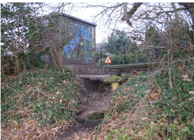
Shortcut and graffitied sub station in northeast corner of car park