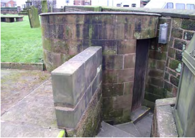
Circular vestry crypt within churchyard of St. Lawrence's