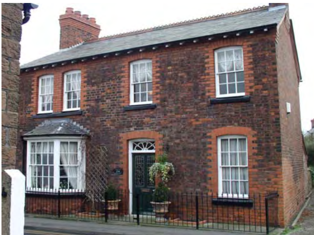
Metal railings to the front of No. 3 Bellemonte Rd.