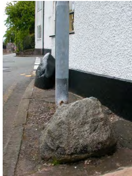
Glacial erratics adjacent to the 'Ring O' Bells'