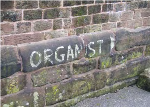
Parking allocations crudely sprayed on Church car park wall