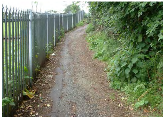
Steel security railings – harsh form of enclosure