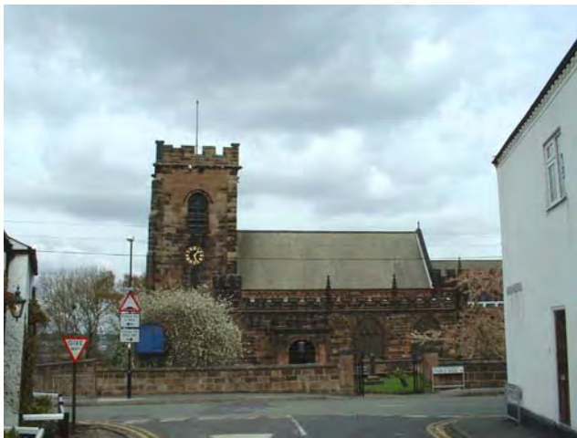
View north along Bellemonte Road towards St. Lawrence's Church