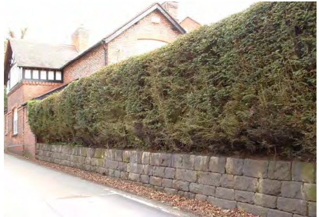
Conifer hedge to rear of No. 25 Howey Lane