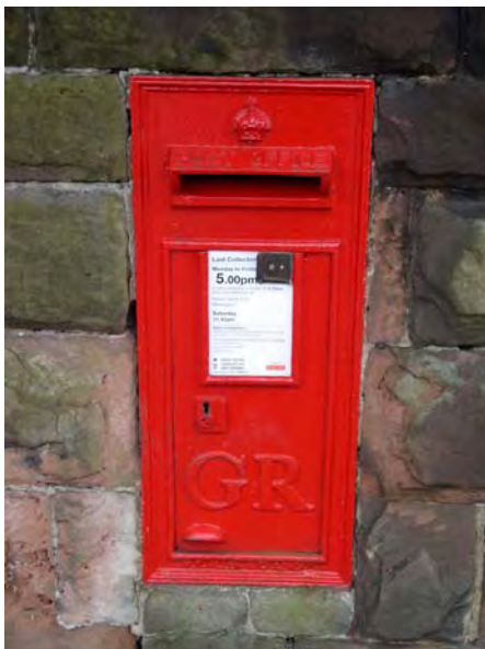
'GR' post box set into sandstone wall